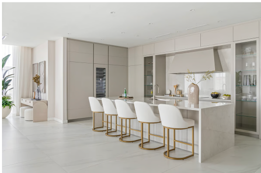
Penthouse 904 Summer Kitchen

The 4,350-square-foot floor plan includes three bedrooms, a den, three full bathrooms, and a half-bathroom, set beneath ceilings that soar to nearly 11 feet. The corner layout allows for multiple exposures, with 504 square feet of terrace space, including a sunset-facing terrace outfitted with a summer kitchen—a feature that transforms everyday meals into al fresco experiences.