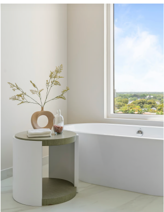
Penthouse 904 Spa Inspired Bathroom

A second private terrace adjoins the primary suite, which also features a morning bar, a spa-inspired bathroom with a soaking tub framed by city views, and custom Porcelanosa ceramics. The Italian-designed closet includes double islands and dedicated space for high-end fashion and accessories—functioning as much as a dressing salon as a storage solution.