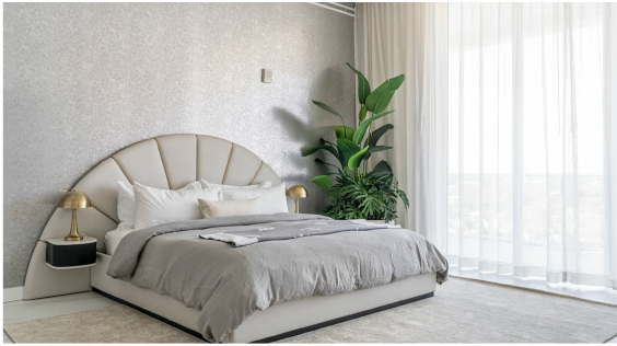
Penthouse 904 Master Bedroom Photos Courtesy of ALINA Residences Boca Raton