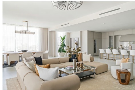
Penthouse 904 Living Space Photos Courtesy of ALINA Residences Boca Raton

Natural light animates the home throughout the day, enhancing a palette of refined materials and understated textures. Details such as the expansive terraces, integrated lighting, and elevated finishes reflect the careful design decisions that shape each ALINA penthouse.