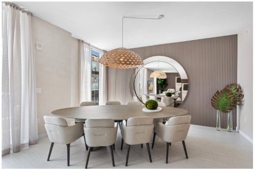
Model Residence 704's grand dining room, featuring natural textures and timeless designs; photo courtesy of ALINA Residences

With more than 80% of ALINA phase two sold, the community is rapidly taking shape. ALINA 210 recently received its Temporary Certificate of Occupancy, with ALINA 220 expected to be completed in late 2024. Once finished, ALINA Residences will encompass three stunning nine-story buildings, totaling 303 units, ranging from one to four bedrooms and offering a variety of floor plans.