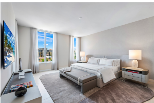
One of three of the model's thoughtfully designed bedrooms with an extraordinary view

The generously sized and thoughtfully designed primary suite offers a spa-inspired sanctuary. The luxurious bathroom, curated by Porcelanosa, boasts porcelain floors, a rain shower within a seamless glass enclosure, and a free-standing bathtub, providing an indulgent retreat for relaxation. The exquisite fixtures and finishes elevate the sense of luxury, ensuring residents experience the utmost daily comfort.