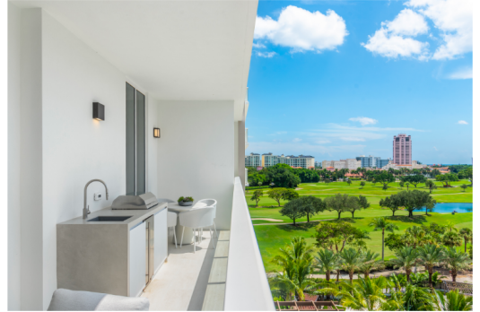
With sweeping views of its downtown area, residents are steps away from the heart of Boca Raton