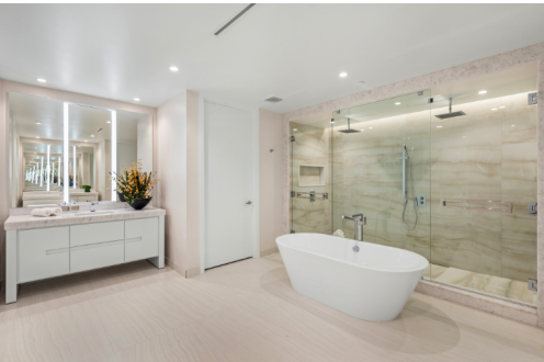
Model Residence 704's spa-inspired primary bathroom; photo courtesy of ALINA Residences

The heart of Model Residence 704 is its designer European-style gourmet kitchen, featuring exquisite porcelain countertops and a waterfall-edge island. Equipped with a full suite of premium Gaggenau appliances—including a wine refrigerator that accommodates up to 99 bottles—this kitchen is a culinary enthusiast's dream.