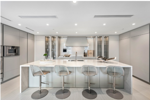
The model's gourmet-style kitchen and exquisite design makes it ideal for hosting gatherings and entertaining; photo courtesy of ALINA Residences

With an impressive 3,241 square feet of meticulously designed space, this fully-furnished residence is a masterpiece of modern architecture and interior design, created by Artefacto, a renowned luxury home furnishings company based in South Florida. Featuring three spacious bedrooms and three and a half bathrooms, the model exemplifies an open-concept layout that invites natural light and enhances the feeling of expansive living. Soaring 10-foot ceilings and 673 square feet of outdoor space, complete with a summer kitchen, create an ideal setting for entertaining guests or enjoying serene moments amid stunning views of the ocean, garden, and Boca Raton golf course.