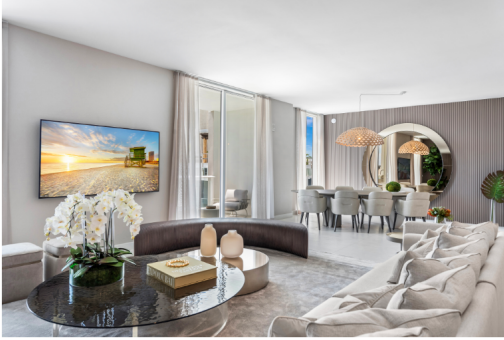
Model Residence 704's open-concept layout, great and dining room

Nestled in the vibrant heart of Boca Raton, ALINA Residences emerges as a beacon of luxury living, showcasing a remarkable synthesis of sophisticated design and unparalleled amenities. The recent launch of Model Residence 704 in ALINA 210, priced at $5.472 million, encapsulates the essence of opulent South Florida living, designed for those seeking comfort and elegance in their everyday life.