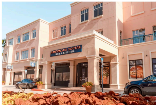
Bar & Kitchen is now open at Mizner Park in Boca Raton. It is the fifth location in the state after Fort Lauderdale, Miami, Orlando and Tampa.

Mizner Park has been home to restaurants, bars and cultural centers such as the Boca Raton Museum of Art since it opened in the 1990s. To meet demand from new residents and tourists, though, many new tenants have moved downtown the past year.