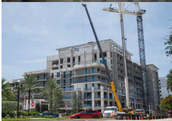
The construction site of the upcoming Alina Residences Phase 2 at 200 SE Mizner Blvd. on Wednesday, July 12, 2023, in Boca Raton, Fla.