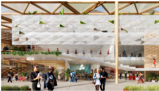
Rendering of the Innovation & Education Center. By its fifth year in operation, the future Boca Raton Performing Arts Center is estimated to be generating an annual $342.5 million for the area, culminating in $10.3 billion over a 30-year period.

As more people and businesses move to Boca, the number of people visiting the city is increasing. And more people, whether residents or visitors, require dining and entertainment options.