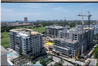
The construction site of the upcoming Alina Residences Phase 2 at 200 SE Mizner Blvd. on Wednesday, July 12, 2023, in Boca Raton, Fla.