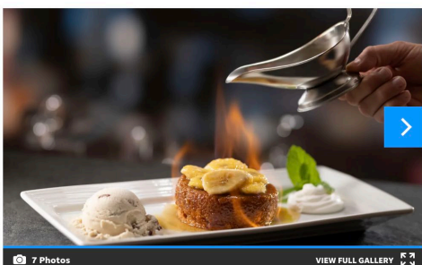
Mizner Park welcomes new fine dining seafood restaurant With locations across the United States, Eddie V's Prime Seafood is now open at Mizner Park in Boca Raton.

"Mizner Park holds the key to Boca Raton's future," read the headline of a 1989 Palm Beach Post article. The area's development — then a recently approved $40 million project — would signal "the true beginning of the downtown renaissance" in Boca Raton, officials proclaimed 34 years ago.