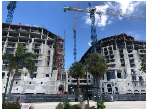
The Mandarin Oriental hotel and residences, under construction in downtown Boca Raton. Alexandra Clough

To keep up with increased tourism, new hotel options are also coming to Boca Raton. The city recently approved the construction of a hotel at Royal Palm Place , and The Boca Raton — formerly known as the Boca Raton Resort & Club, and known for its signature, Addison Mizner-style pink façade — is undergoing a $200 million facelift.