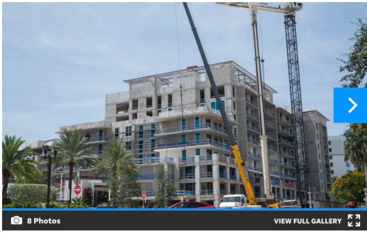
A closer look at new developments in downtown Boca Raton A closer look at developments in the downtown Boca Raton area including Camino Square and Alina Residences