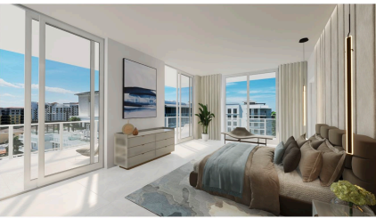
ALINA 210 Penthouse El-Ad National Properties