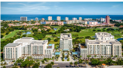
(Left to Right) ALINA 200, ALINA 210, ALINA 220 in Boca Raton El-Ad National Properties

ALINA Residences broke ground on its phase two development in March 2022. Once phase two is complete, which is projected to occur in late 2024, ALINA Residences will be complete, comprising three total buildings: ALINA 200, ALINA 210 and ALINA 220, for a total of 303 residences.