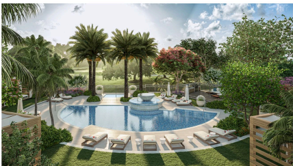
Pool at ALINA 210 El-Ad National Properties

In addition to enjoying access to exceptional amenities at ALINA 200 and ALINA 220, the 30 residences at ALINA 210 will have an exclusive suite of thoughtfully curated amenities, including a private spa with dry sauna, aroma steam rooms, salon/treatment area, private locker rooms, state-of-the-art fitness facility and a bungalow style pool with poolside cabanas.